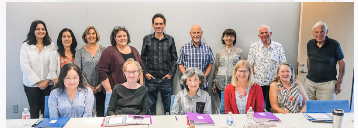
New tutors from October 2019 training.

If you're familiar with the NMPL, you know we can always use more tutors! We were thrilled to see a room full of smiling faces ready to help their community.