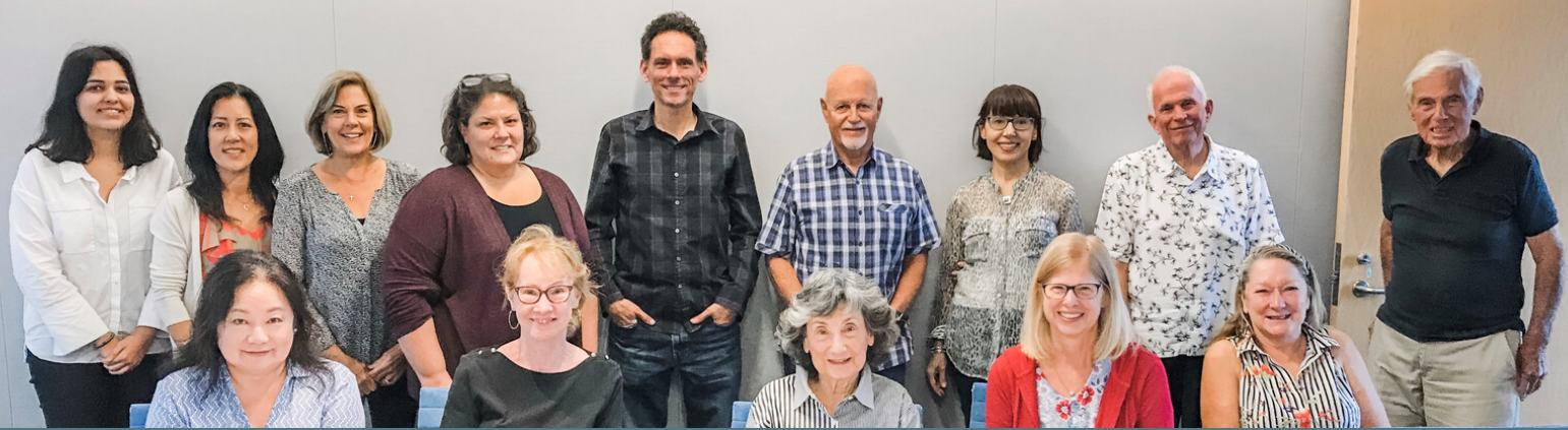
Pictured above: NMPL's most recent class of graduating tutors (See Page 2)