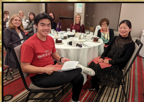
Volunteers, Learners & their families attended