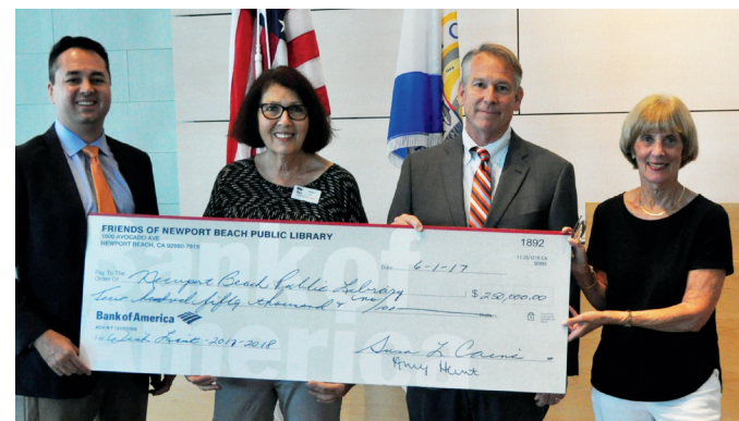
The Friends of the Library presents the City with a check in support of library programs. The Friends contributes about 200,000 per year to enrich the Library's programs, collections and services.

Support from the Friends of the Library plays a pivotal role in the library experience of children, families and adults in this community. It is essential to the Newport Beach Public Library and its mission. When you become a Friend of the Library you become a member in an important philanthropic group. Collectively, the Friends help make possible children's and cultural arts programming, expanded collections, state-of-the-art technology, and a vast array of educational and entertainment resources.