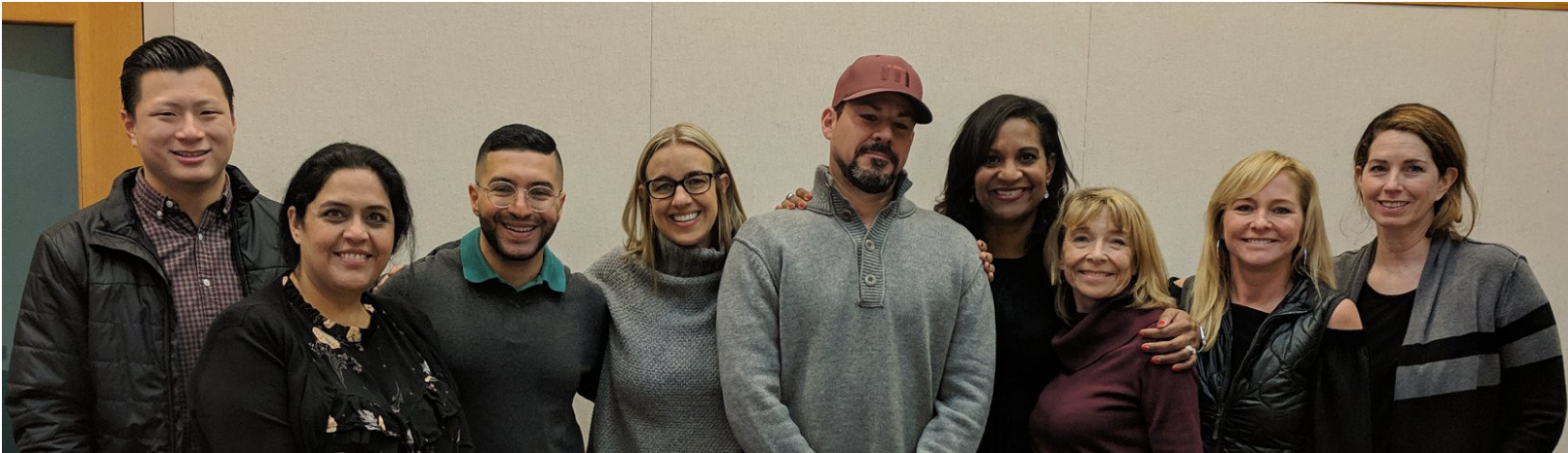
Pictured above: Your 2019 Literacy Advisory Board