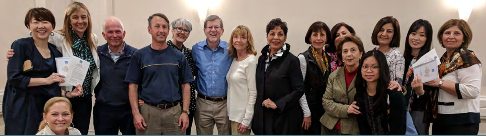
Pictured above: NMPL at the 2019 SCLLN Writer to Writer Awards MAY/JUNE 2019

A publication of Newport/Mesa ProLiteracy, a program of the Newport Beach Public Library