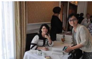
Happy Faces from the 2018 Gift of Literacy luncheon

- Newport/Mesa ProLiteracy Mission Statement