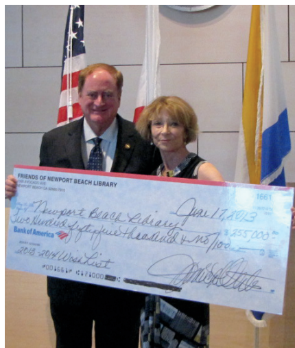
The Friends of the Library presents the City with a check in support of library programs

Support from the Friends of the Library plays a pivotal role in the library experience of children, families and adults in this community. It is essential to the Newport Beach Public Library and its mission. When you become a Friend of the Library you become a member in an important philanthropic group. Collectively, the Friends help make possible children's and cultural arts programming, expanded collections, state-of-the-art technology, and a vast array of educational and entertainment resources.