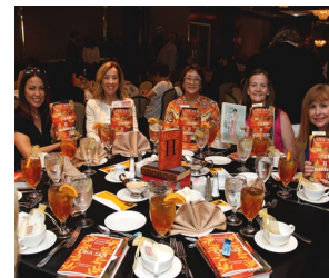
Guests eager to read Lisa See's latest novel, The Tea Girl of Hummingbird Lane